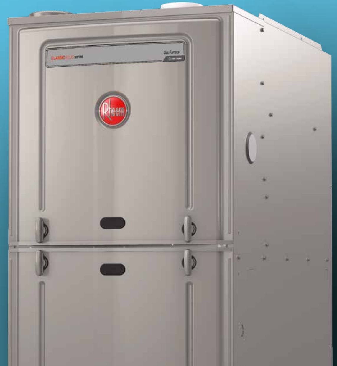
Upflow model shown

From the smallest part to complete comfort systems, we build quality into everything we make so we can be sure it's tough enough to deliver the ultimate performance you can count on day after day, year after year. That reliability is what makes Rheem different—and better.