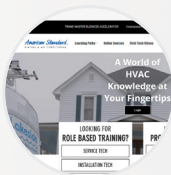
Training and E-learning courses

Throughout 2022, resources will be made available to provide education on the regulatory changes; awareness of product phase in/out timelines; and updated consumer product literature.