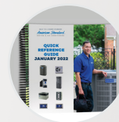
Updated Product Handbook