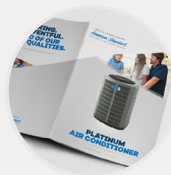
Updated consumer product literature